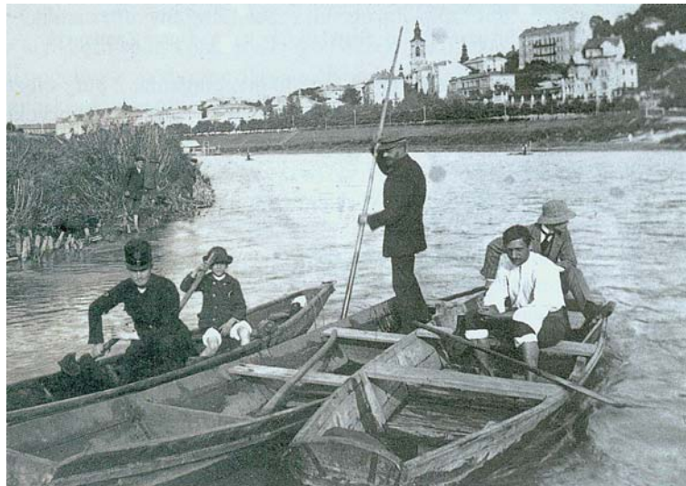
Figure 2. Przemyśl 1913. Trip by bouts on the river San