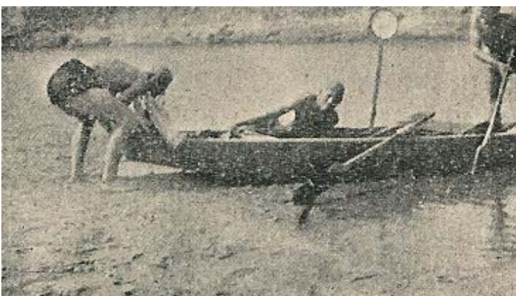
Figure 8. Canoeing in Polesie 1933