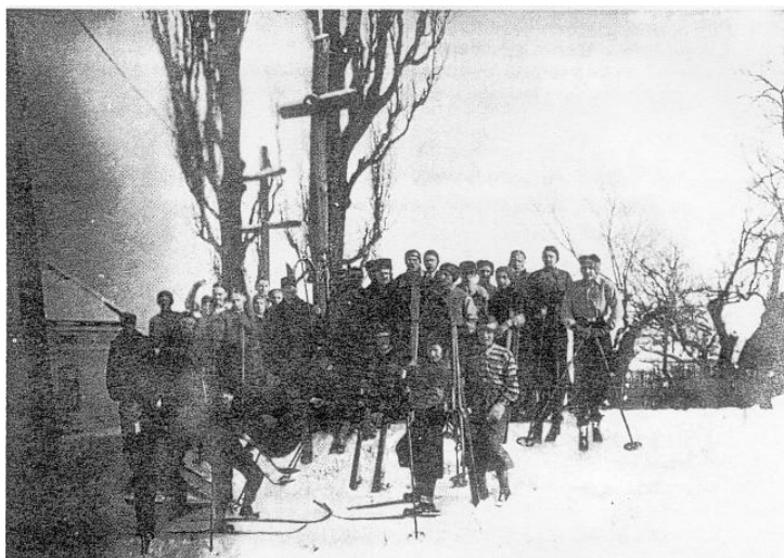
Figure 11. Wandering on skis