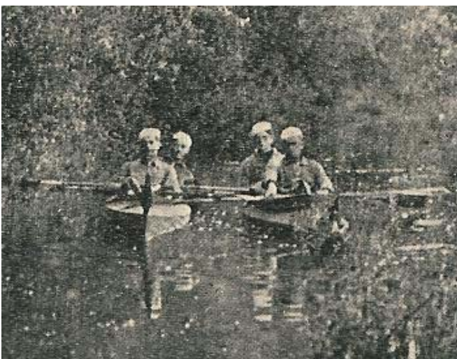
Figure 7. Canoeing in Weresznica