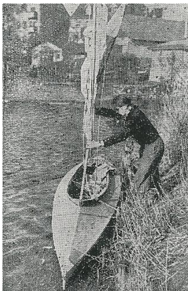
Figure 9. 1937. Canoeing Tourism on the river Dnestr