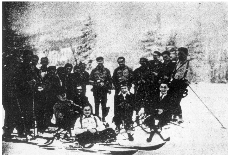
Figure 12. During the trip on skis