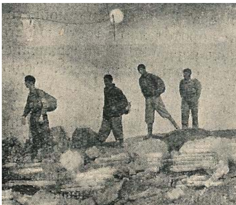
Figure 5. In wilderness of the range of Czarnohora 1932 y.