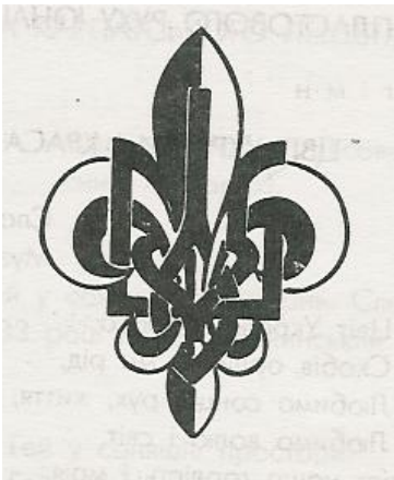
Figure 1. The symbol of the Ukrainian youth scouting organization "Plast"