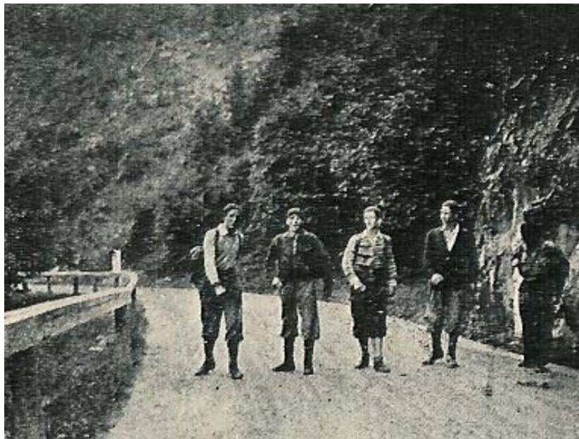
Figure 6. During the march from Doria to Worochta