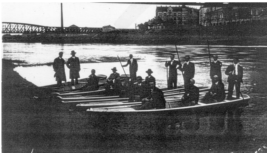
Figure 3. Przemyśl 1937. Evening trip on the river San