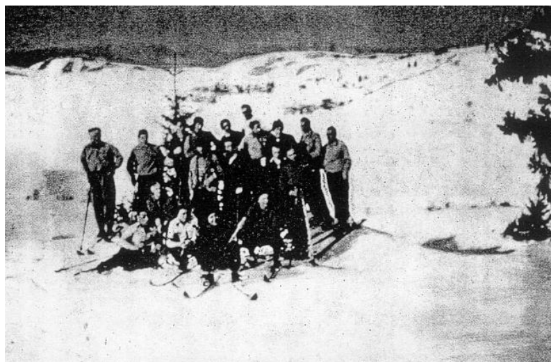
Figure 13. 1934, commemorative photograph from the trip to Worochta