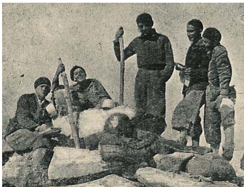
Figure 4. Walking tour in the region of Gorgony. At the top of “Siwula” in 1931 y.