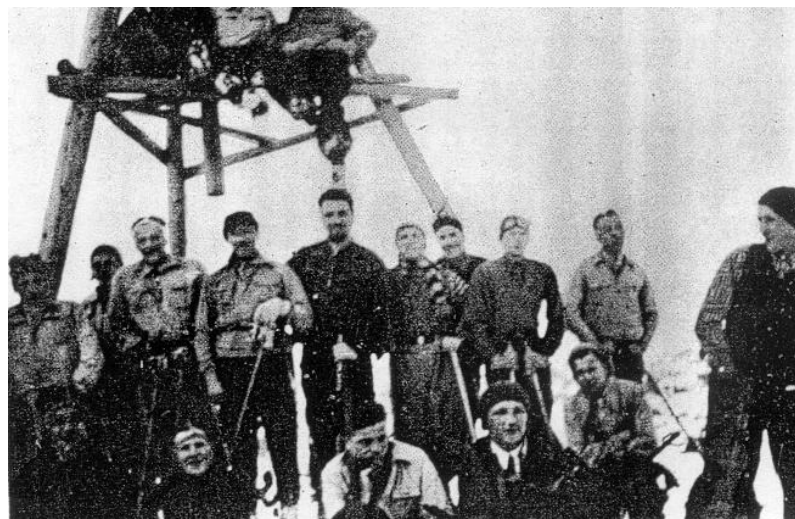
Figure 14. 1934, the trip to Worochta