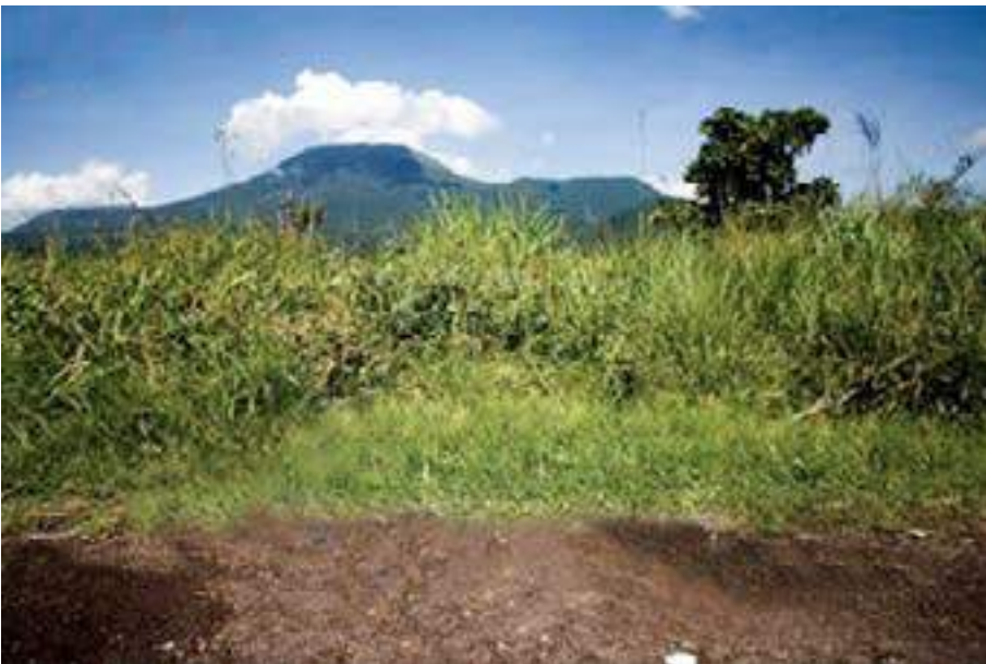
2008, Democratic Republic of the Congo

Sudanese rebels with the National Redemption Front, NRF, walk past dead Sudanese government soldiers as they walk through a temporary military camp near the Darfur-Chad border in Iriba.