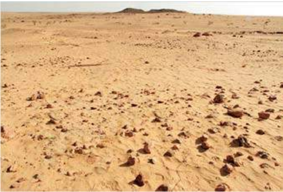
2007, Chad - Sudan

Sudanese rebels with the National Redemption Front, NRF, walk past dead Sudanese government soldiers as they walk through a temporary military camp near the Darfur-Chad border in Iriba.