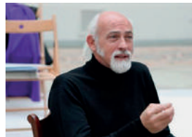
Ross Lovegrove | Doctor Honoris Causa 2010