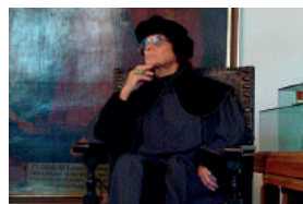
Magdalena Abakanowicz | Doctor Honoris Causa 2002

Any queries concerning enrolment should be directed to: study@studyarts.pl