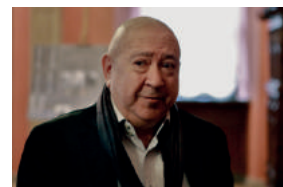
Christian Boltanski | Doctor Honoris Causa 2008